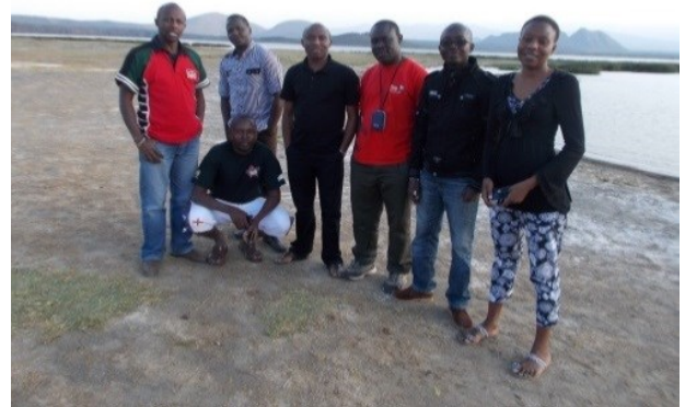
The Field team members in a team building session

To enhance communication and team work, improve the existing trust, strengthen the bondage within the field team, profile and appreciate the different personalities with the intent of exploiting the strengths and uniqueness of each individual. A two day's team building activity was organised and the team left the session re-energised, united and focussed in improving their outputs. The result of this cannot be overemphasised as the performance is top-notch!